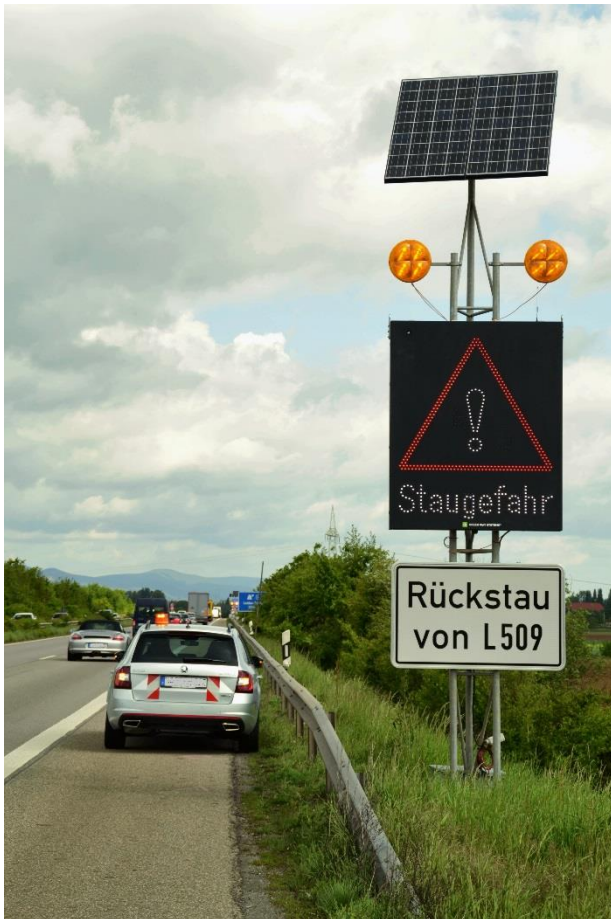
Pic 1: display location traffic jam warning

All system components are operated energy self-sufficient via solar energy plants with battery buffering.